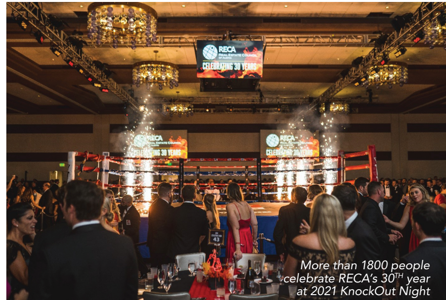
More than 1800 people celebrate RECA's 30 TH year at 2021 KnockOut Night