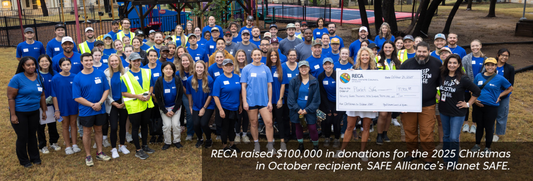
RECA raised $100,000 in donations for the 2025 Christmas in October recipient, SAFE Alliance's Planet SAFE.