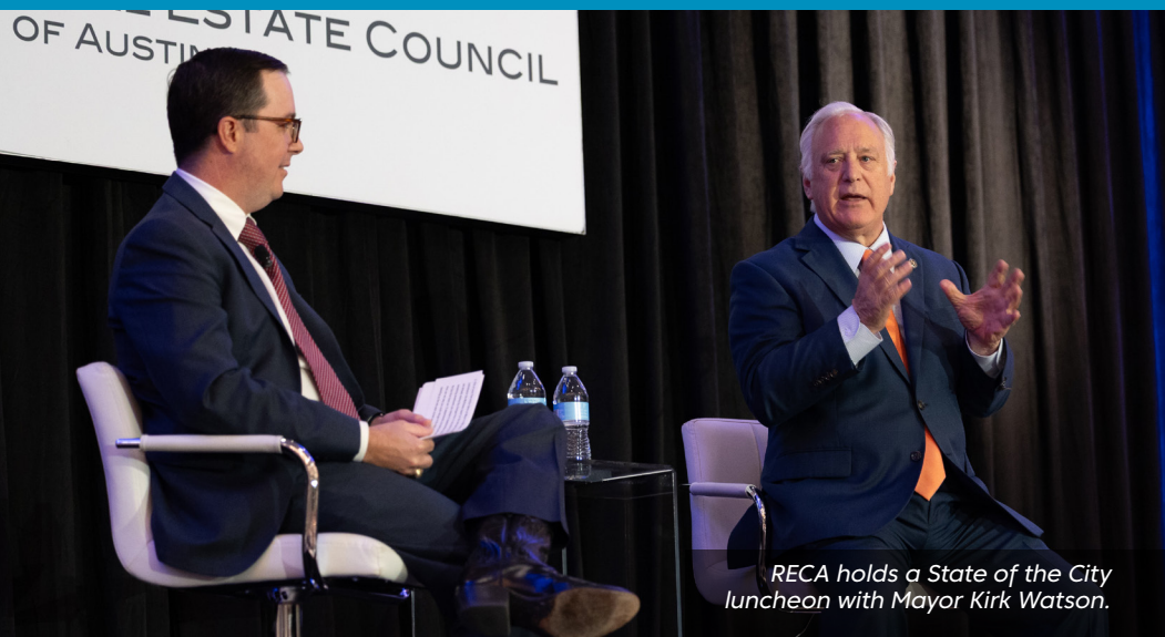
RECA holds a State of the City luncheon with Mayor Kirk Watson.

The Real Estate Council of Austin is the premier advocacy organization for the Central Texas commercial real estate industry. RECA's mission is to serve as an effective resource and advocate for the commercial real estate industry and advance civic leadership in support of responsible development and a livable Austin.