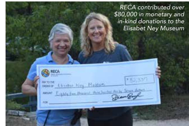
RECA contributed over $80,000 in monetary and in-kind donations to the Elisabet Ney Museum