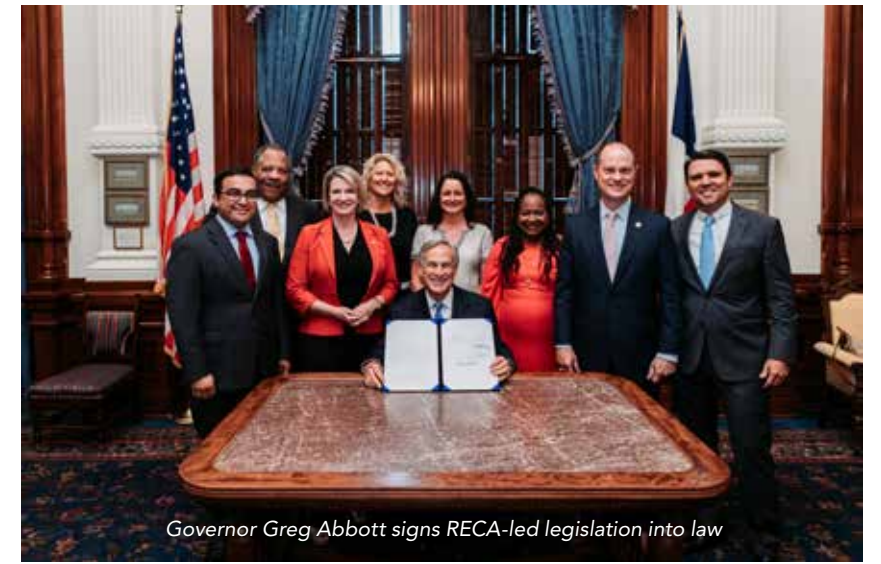
Governor Greg Abbott signs RECA-led legislation into law