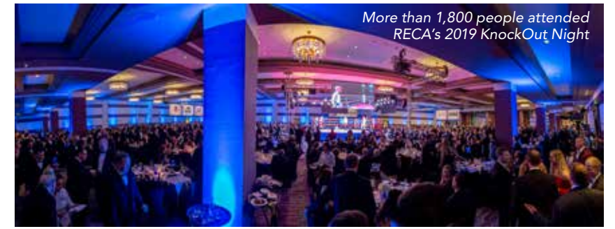
More than 1,800 people attended RECA's 2019 KnockOut Night